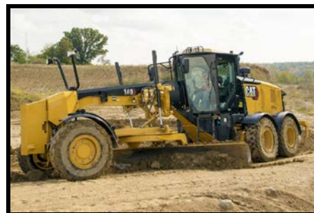
Cat 140 Road

The town has solicited a bid from Milton Caterpillar for a new 2024 Cat 140 AWDJOY Road Grader. The dealer’s selling price for the new grader is $425,000.00 less the trade-in value for the existing 120G grader. The after-trade-in cost is $377,500.00.